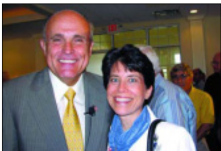
Former New York Mayor Rudy Giuliani