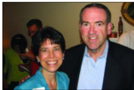
Former Governor Mike Huckabee.